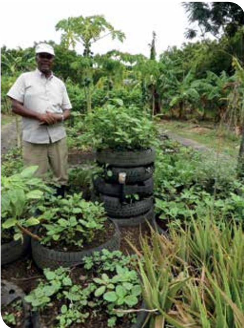
Resilient farming systems encourage diversity, such as in vertical gardening in Kenya.

It took place from 2012 to 2015. At the heart of the programme are its members around the world, also referred to as the agricultural biodiversity community (ABC): a global knowledge and experience network with members from practitioner organisations mostly from the global south, and international research institutions.